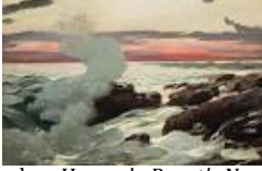
Winslow Homer's Prout's Neck

$775 per person based on double occupancy with deposit by March 2, 2014 $800 per person after March 2, 2014 / Single supplement $350 additional