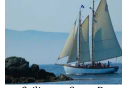
Sailing on Casco Bay

Pack your suitcase, sketch book and camera, and get ready for three days of extraordinary art, the dramatic coast of Maine, and the salty mist of the ocean spray against the rocks. Maine is known for its rocky coastline, sandy beaches, wonderful seaside inns and lobster dinners. This trip will embrace all of this plus a visit to one of the most charming museums in the Northeast: Isabella Stewart Gardner Museum in Boston. We'll sail on a wooden windjammer on Casco Bay (weather permitting), and visit both Portland and Freeport. You'll have time to dip in the heated saltwater pool of our hotel, walk the sandy beach and experience the waves crashing against the rocks on the magnificent cliff walk.